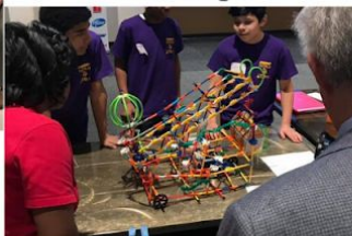
STEM Design Challenge