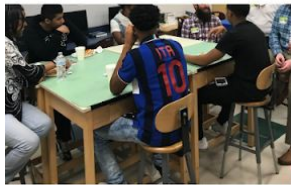
Lunch with an Engineer