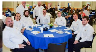
Education & Business Leaders' Summit