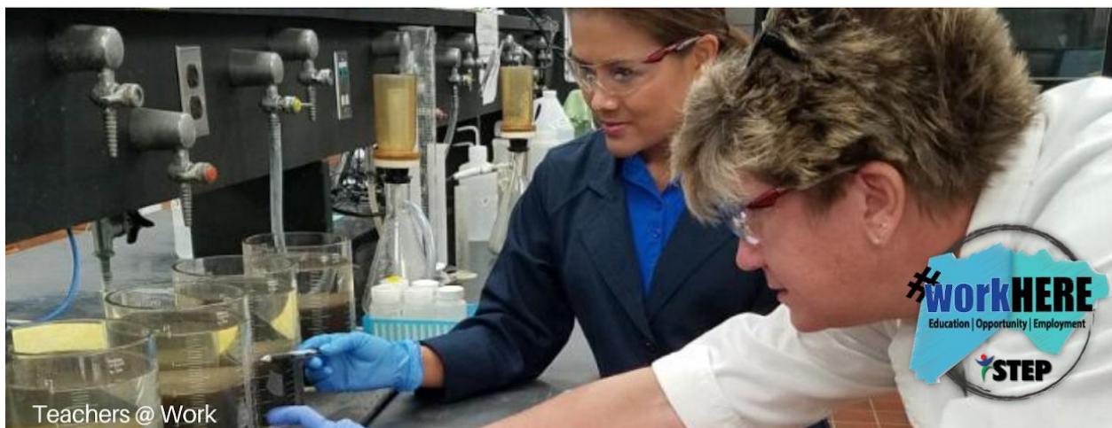
Teachers @ Work